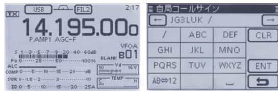
Tap C Showing Multi-Function Meter